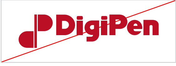
remove “DigiPen Institute of Technology”