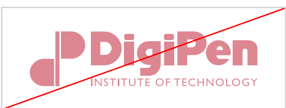
alter the transparency