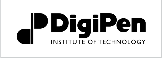
black logo on light background