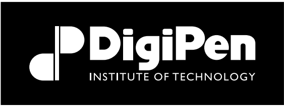
white logo on dark background

The logo may be placed on top of colored backgrounds or photographs, as long as it remains clearly legible.