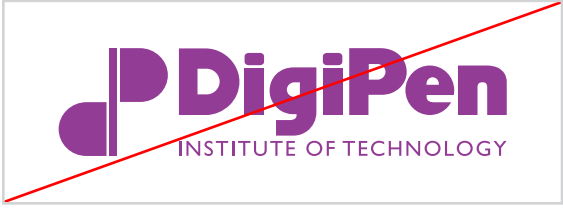
change color (other than specified)