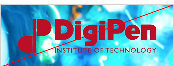
use overly complicated background