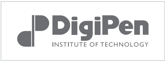
dark grey logo on light background