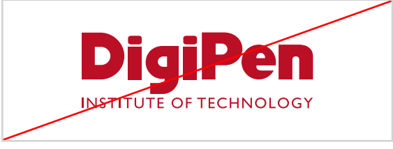
remove the “DP” icon