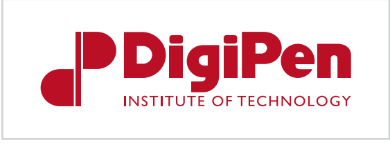
red logo on light background

The DigiPen logo requires a minimum blank space around it. The letter D can be used to define this blank space.